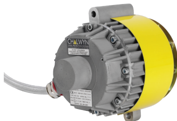
Self-excited flameproof alternator