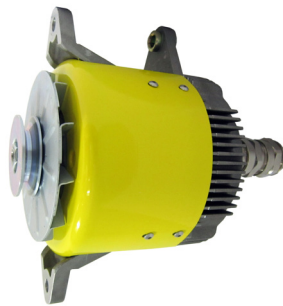
High output flameproof alternators